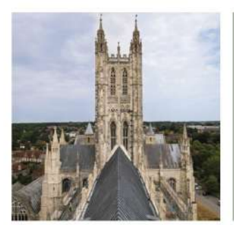
AWARD-WINNING CONSTRUCTION SPECIALISTS